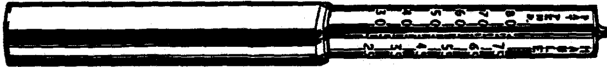
VIEW OF MAULE FABRIC TESTER